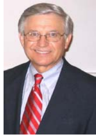
From Pigg's Pen...