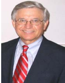
From Pigg's Pen...