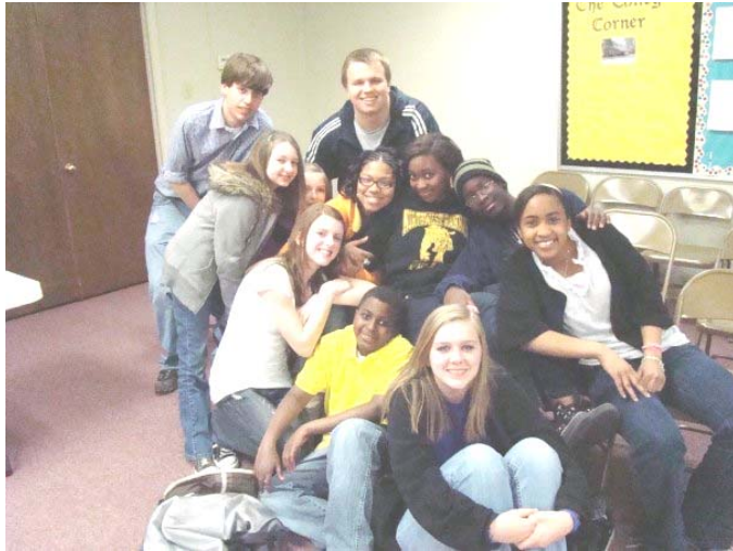
Lake Harbour teens at J.A.M.

I am very proud of the growth I continually see in our youth group. I have been blessed to see young boys and girls in Mexico throughout our trip. I am excited about how God is working in their lives, too. Please be prayerful about future mission opportunities with the Lake Harbour Youth Ministry in Mexico.